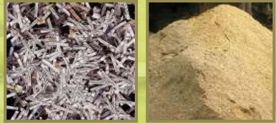
Examples of bedding

There are also various types of bedding to choose from, making it easy to choose the best type of bedding for you and your horse. Kinds of bedding and their pros and cons include: