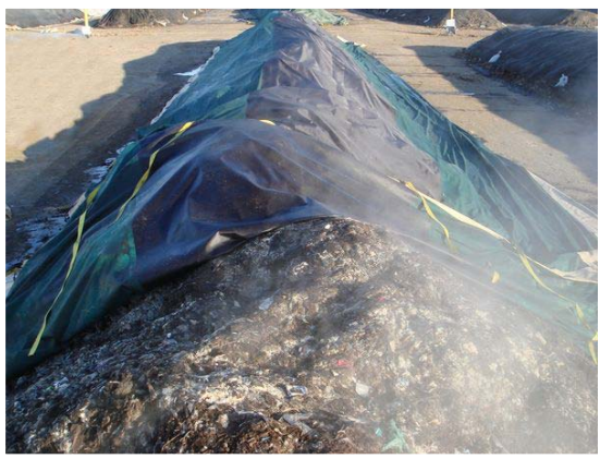
A covered compost pile