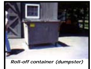
Roll-off container (dumpster)

Remember to consider the type and size of equipment that will be used to remove the manure, and make the necessary accommodations in the planning/design process.