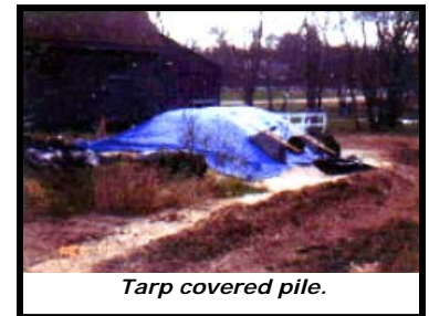
Tarp covered pile.