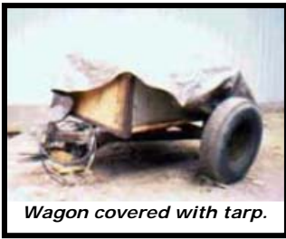
Wagon covered with tarp.

Assuming you have figured out your disposal strategy (or at least you are working on it), what do you do with your horse waste between disposal events? A manure storage structure or area serves as a temporary holding area until materials are removed for utilization on or off the farm.